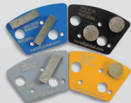
TOOLING & CONSUMABLES