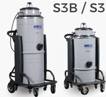
S3B / S3BC