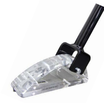
STAND-UP CARPET DICER