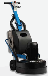
GRINDERS & POLISHERS