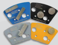
TOOLING & CONSUMABLES