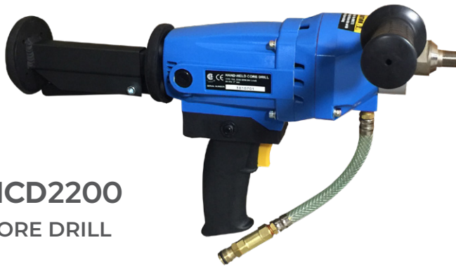
HCD2200 CORE DRILL

"The Mongoose Drill" designed to drill up to 6" diameter mongoose bits and 3" diameter wet bits