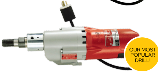
MILWAUKEE 4096 SLIP CLUTCH MOTOR