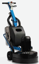
GRINDERS & POLISHERS